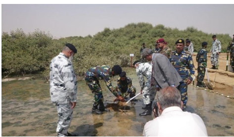
Pakistan Navy launches campaign to plant a million mangroves