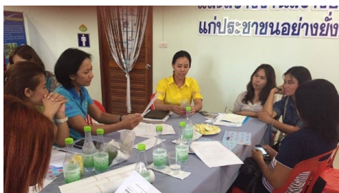
Phase 3 of a Small Grant Facility project that strengthens resilience of Ao Trat coastal community launched