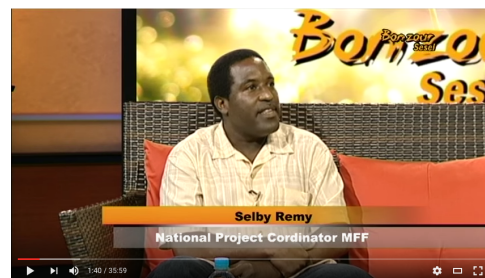
MFF on Bonzour Sesel TV Show

(This video is currently in French. A video with English subtitles will be uploaded soon.)