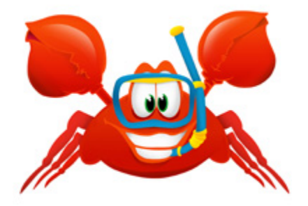
Meet Dr Crab, the "Fishtales" mascot

Whilst focusing on Indian examples, the site will cover all marine and coastal ecosystems around India including mangroves, coral reefs, sandy and rocky beaches, and wetlands. Games, illustrations and photos will supplement the learning experience to create useful learning tool for youth around the region, particularly in other MFF countries.