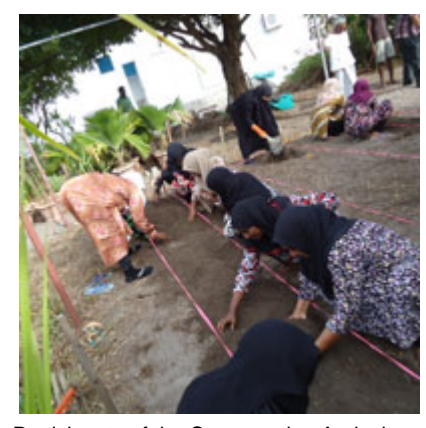
Participants of the Conservation Agriculture Training Programme practicing the practical component in Dharavandhoo Island, Baa Atoll, North Province, Maldives in November 2011

Addressing nutrition is also a key component of the project. Following workshops with health professionals, the communities took part in a competition to prepare the most nutritious meal with locally available products. Live & Learn will compile the recipes made by the communities during the competition as an output from this project.