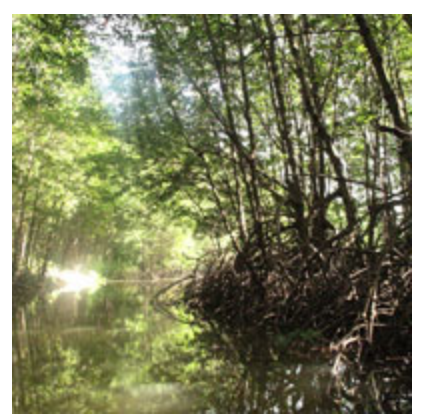
Mangroves in the Can Gio Biosphere Reserve

The MFF National Coordinating Body (NCB) in Viet Nam held their meeting in the Can Gio Biosphere Reserve, 50 kilometers south of Ho Chi Minh City (HCMC). Can Gio is the largest mangrove forest in Vietnam and is one of the most extensive mangroves plantations worldwide. It was listed as a Biosphere Reserve in 2000 in recognition of its multiple roles: reducing the salt-water intrusion, preventing discharge of solid trash into the sea, acting as an air pollution filter, and barrier to storm damage; yet with potential for environmental education, scientific research and eco-tourism.