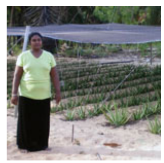
Women standing in front of an Aloe vera plantation

A Sri Lankan organisation that received funding for a Phase 1 MFF Small Grant Facility project has won a SEED Award. The SEED Initiative is a global partnership for action on sustainable development and the green economy. The Award is a recognition of particular achievements in innovation and entrepreneurship, promising efforts to promote economic growth, social development and environmental protection, and not least the potential of the project to inspire others. The winning project was implemented by the Marine & Coastal Resources Conservation Foundation and introduced farming of Aloe vera as an alternative income generation for fisherwomen near Puttalam, Sri Lanka.