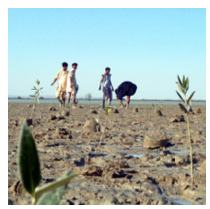
Youth planting mangroves, Gawater bay, Balochistan, Pakistan

Save the Nature is surveying degraded areas and consulting with local inhabitants and preliminary restocking activities were conducted in conjunction with the youth group. The young people have already been involved with preliminary mangrove planting activities and are demonstrating great potential with 20 out of the planned 50 hectares of completed by the end of 2011. Using youth group in the forefront has the potential for this project to show promising results as until to date they managed to achieve around 20 hectares of mangrove plantation out of targeted 50 hectares.