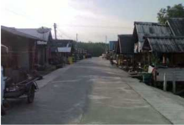
Baan (village) Koh Kham is a Muslim village between mangrove and landed forest. Looming in the background is one plot of community forest.