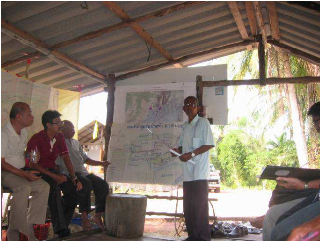
One of community elders who experience ecosystems degradation during the past decades related the development history of the his villages using the map and chart as shown. His village currently takes car of about 200 ha of mangrove.