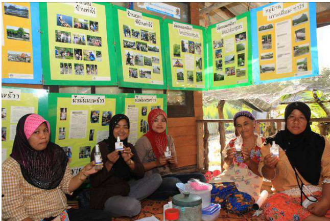
Representatives of women's group in each participating village proudly presented their product made from natural resources of their protection. Sets of photos on the wall depict undertaken activities and respective results of each project location.