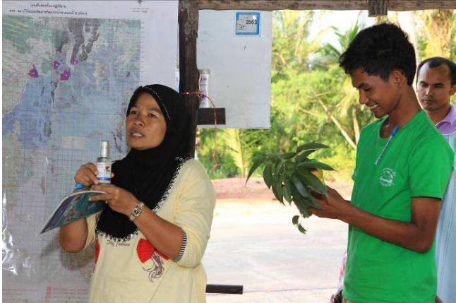
One woman leader and a member of youth group explain her product made from a species in mangrove. The product is used as shampoo.