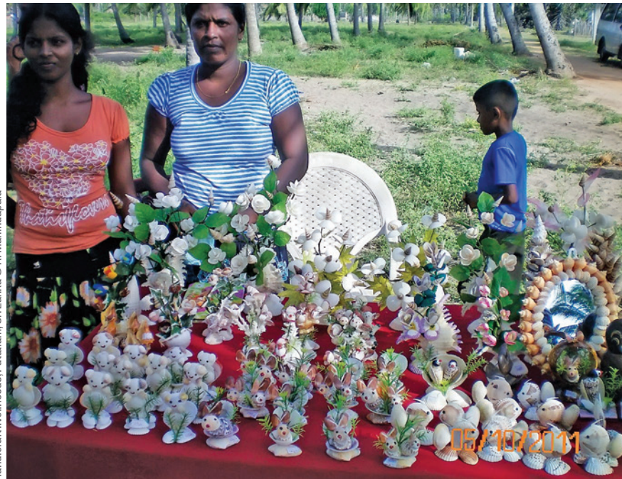
Handicraft livelihoods, Puttalam, Sri Lanka