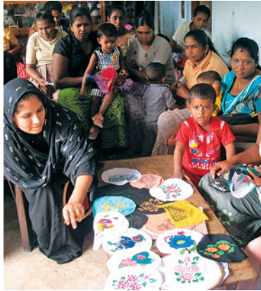
Handicraft class, Puttalam, Sri Lanka