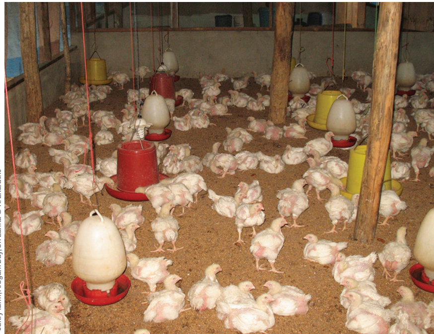
Poultry farm, Arugam Bay, Sri Lanka