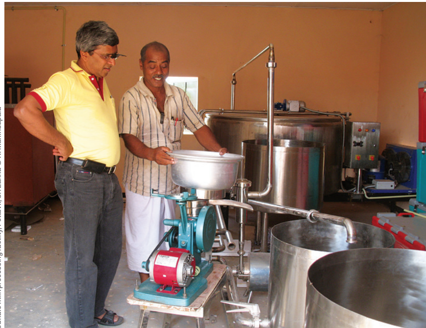
Buffalo milk processing facility, Pottuvil, Sri Lanka