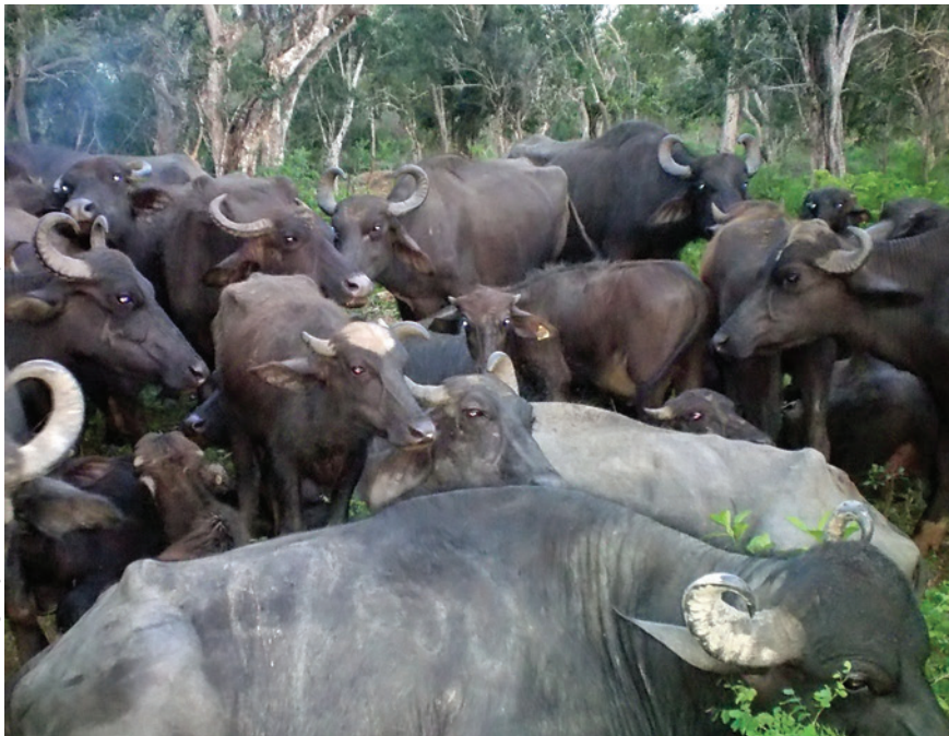
Buffaloes managed by widows, Pottuvil, Sri Lanka

ing standards of widows and families headed by women. In 2007, LDDFA received 30 buffaloes from GTZ (German Technical Cooperation), and in 2008 another ten from the UNDP Small Grants Programme, for widows in Pottuvil to tend. LDDFA secured a small grant from MFF to buy eight more animals and help another eight widows. Through this grant, LDDFA aimed to raise the living standards of these women by giving them a productive asset which they could use to earn extra income.