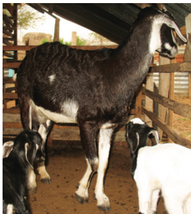
Goat farm, Sri Lanka