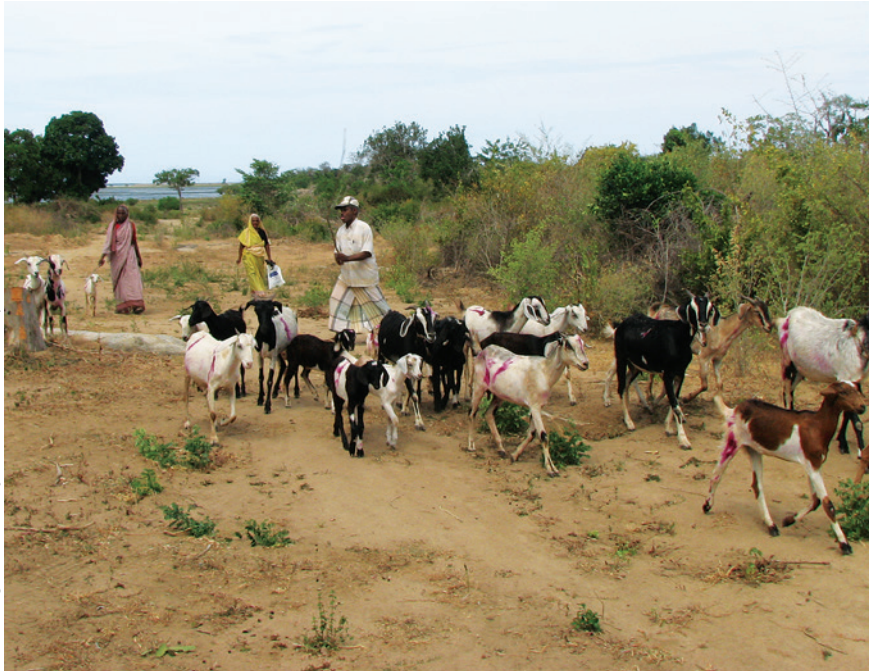
Goat farming and community, Sri Lanka

area for goat production and livestock rearing projects are gradually expanding.