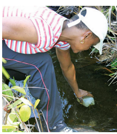
Collecting a water sample, Pasquière River, Praslin, Sevchelles