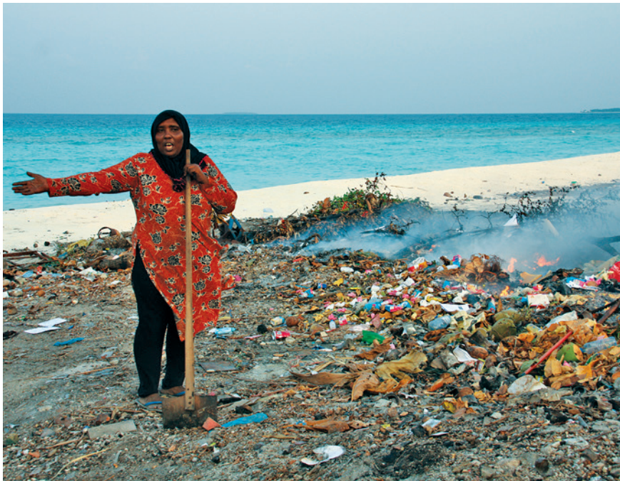
Waste on Hoarafushi Island, Maldives

The project produced awareness materials in the local language and disseminated them to all target households in the island.