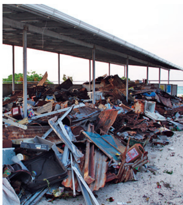
Waste management centre on Hoarafushi Island, Maldives

Tel: +960 7908979 +960 6500042 Fax: +960 6500017