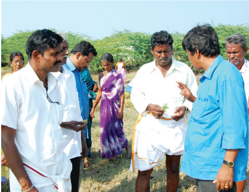
Assessing mangroves, Tamil Nadu, India

sedimentation processes. The importance of hydrological regimes is now understood but weaknesses still remain. For instance, 90% of the mangroves currently being planted are Avicennia marina , neglecting other species in need of regeneration. Second, inadequate attention is given to community livelihood issues. Third, village planning institutions lack the technical, social and economic capacity to sustain mangrove restoration efforts. This project addressed these issues in the states of Tamil Nadu and Andhra Pradesh.