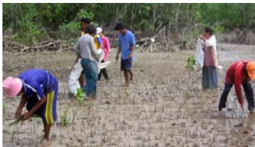
Mangrove rehabilitation in Koh Phra Thong, an island off the Andaman coast of Thailand

Restoring a mangrove community to its full complement of biodiversity is very difficult, and there have been many recorded failures. Already many post-tsunami planting efforts are encountering problems, with high mortality of seedlings. A re-assessment of restoration programmes is needed urgently, and