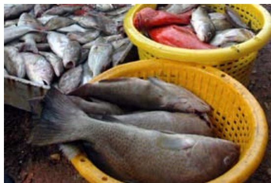
Fish catch, Sri Lanka

an urgent need for mangroves to be conserved and better recognised for the important role that they play in supporting and protecting coastal communities. Good coastal management and rational resource use, coupled with protective measures for key areas, could reverse the current dangerous trend of mangrove over-exploitation, conversion and destruction.